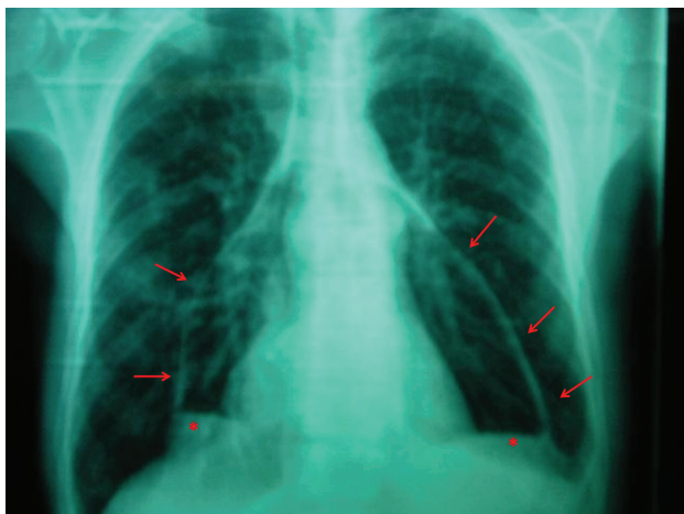
Fig. 1. Posteroanterior chest-X ray. The radiolucent band corresponds to air (arrows) surrounding the cardiac silhouette separating both pericardial layers, with opacity corresponding to fluid (asterisks) in the lower part of the pericardial sac.