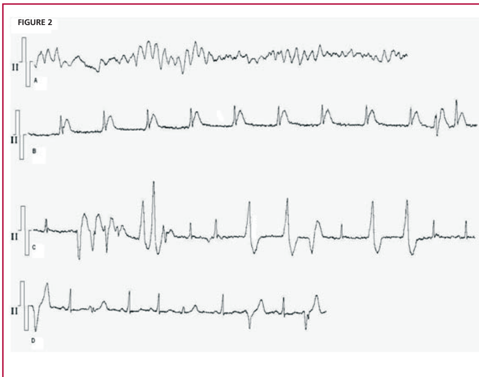
Fig. 2. Tracings at 25 mm/s, 1 cm = 1 mV. Episode of ventricular fibrillation and ECG at 10 minutes, an hour, and five days after the event. Strips, from top to bottom show: first - A) Ventricular fibrillation causing sudden death; second - B) Ten minutes after the event and the external electric shock, sinus rhythm with prominent J wave (4 mm magnitude) in DII, DIII and aVF (which did not exist), and short QT interval of 280 ms; third - C) An hour later, short J wave, ventricular extrasystoles of up to seven complexes, not too premature, and with different shapes in the same lead. An episode of self-limiting torsade de pointes and normal QT interval is observed; fourth D) Five days later, coupled ventricular extrasystoles, with different shapes in the same lead. There is sinus tachycardia; neither J wave nor short QT interval is observed.