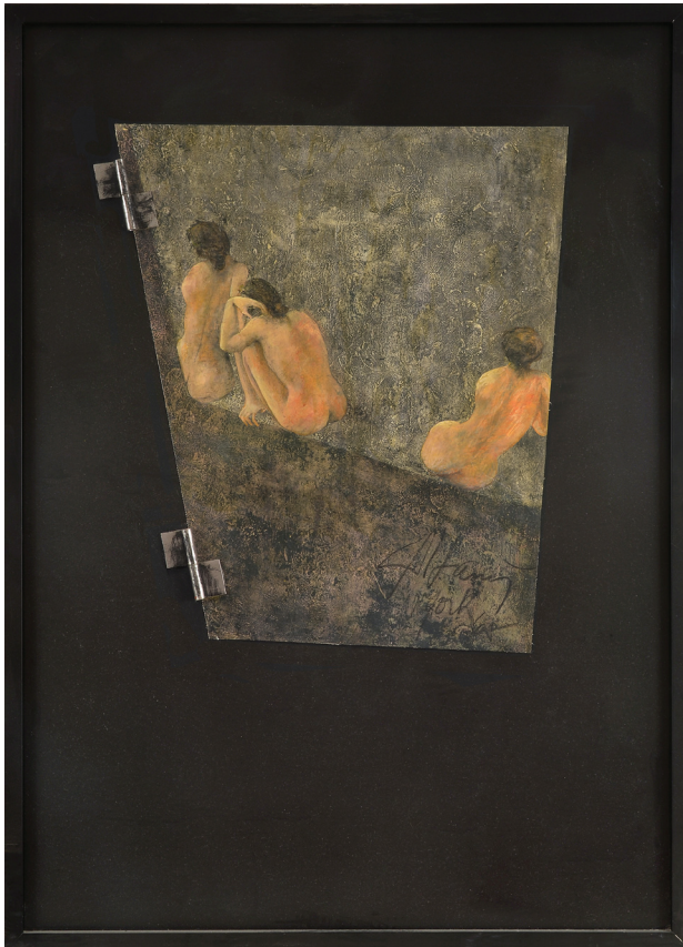
"Permanence in the time of uncertainty"

Mixed technique on wood, paper and charcoal, metal hinges, 100 x 130 cm