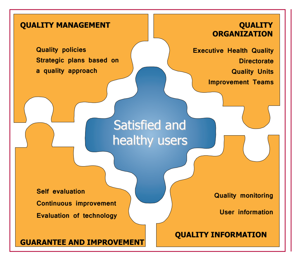
Fig. 2. Components of the health-care system.

The healthcare system is a real puzzle (Figure 2).