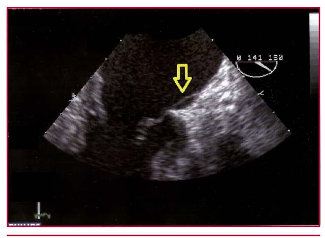
Fig. 2. Transesophageal echocardiography. View at 141°. Image of false tendon attached to the left atrial wall (arrow) is observed, with no interference in mitral leaflet function.