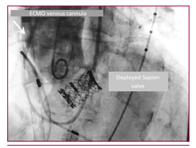
Fig. 2. Deployed Sapien prosthesis in aortic position.